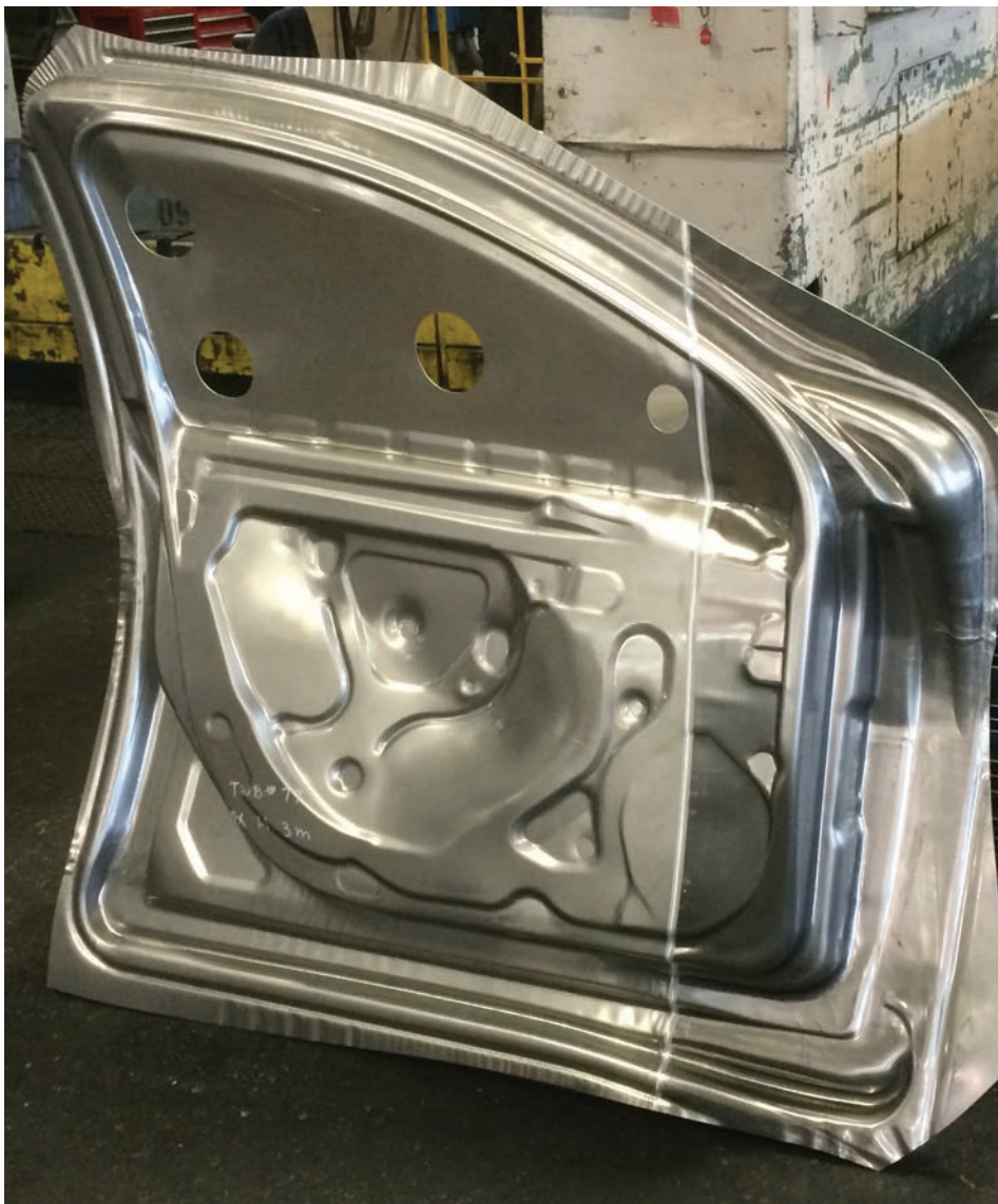
Fig. 4 – TWB Company and GM are both experimenting with high-speeds friction stir welding of their manufactured car parts. TWB can produce welded blanks for an aluminum door that is 62% lighter and 25% cheaper than before.

TWB Company can now produce welded blanks for an aluminum door that is 62% lighter and 25% cheaper than was previously possible — Fig. 4.