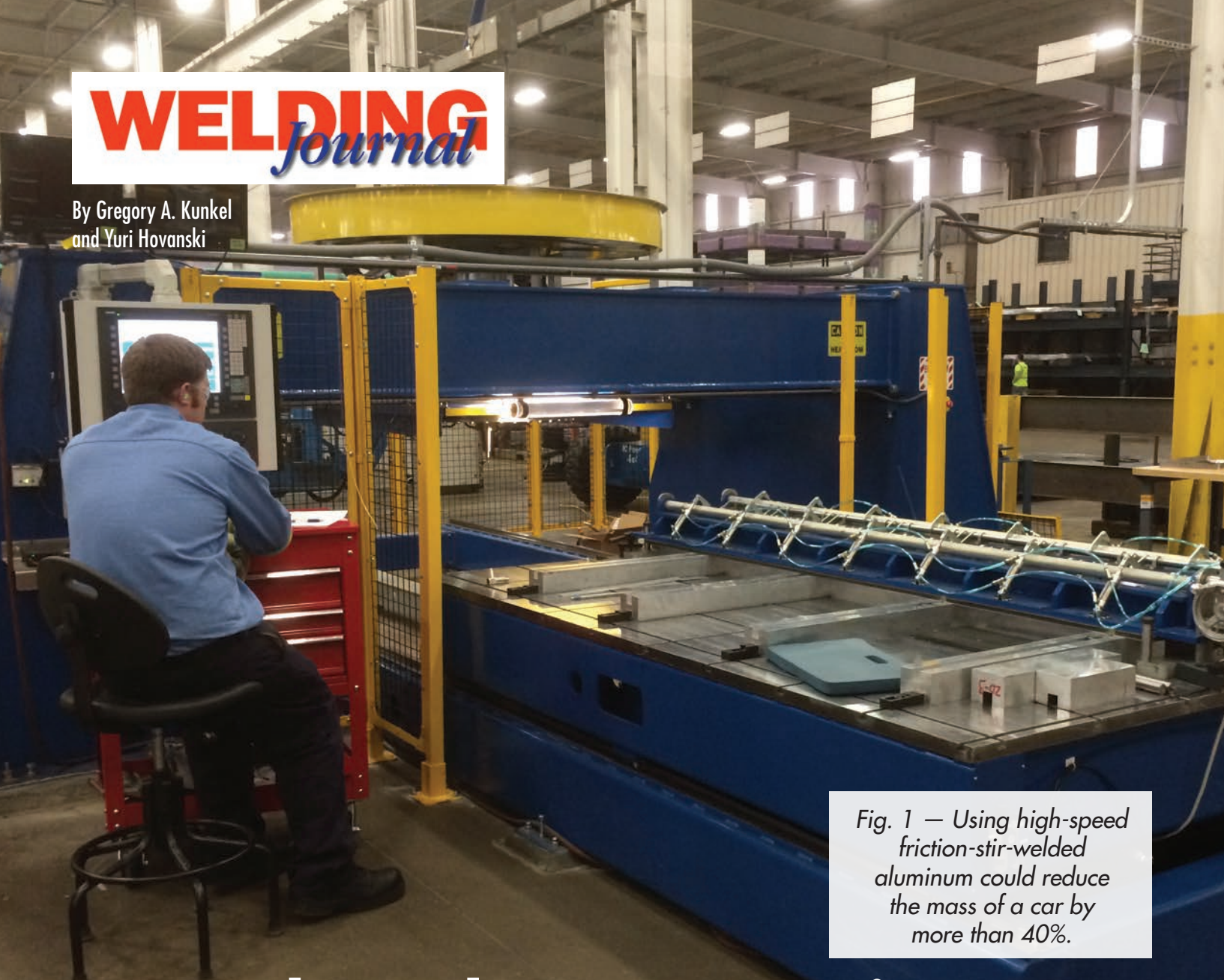
Fig. 1 — Using high-speed friction-stir-welded aluminum could reduce the mass of a car by more than 40%.